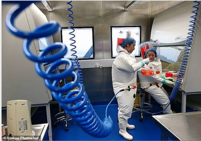
Inside Wuhan Institute of Virology 2017

B ack in 1967, just before I left for Vietnam, I was the Nuclear, Biological and Chemical Warfare officer for the Yuma Marine Corps Air Station. In those days, we believed the priority for the implements of war were first guns (expensive), then nuclear (very expensive), then chemical (fairly inexpensive) and finally biological (cheap). We gave the least priority to biological weapons because, although they were cheap to make, they were difficult to control and without an effective vaccine for the friendly troops, could backfire on a combatant.