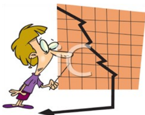
Financial Crisis Report