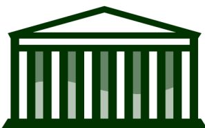
Advancing in a Time of Crisis